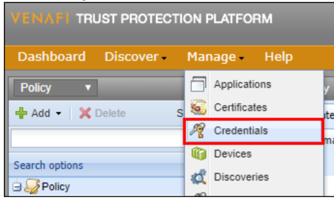
FIGURE: DEFINE USER CREDENTIALS