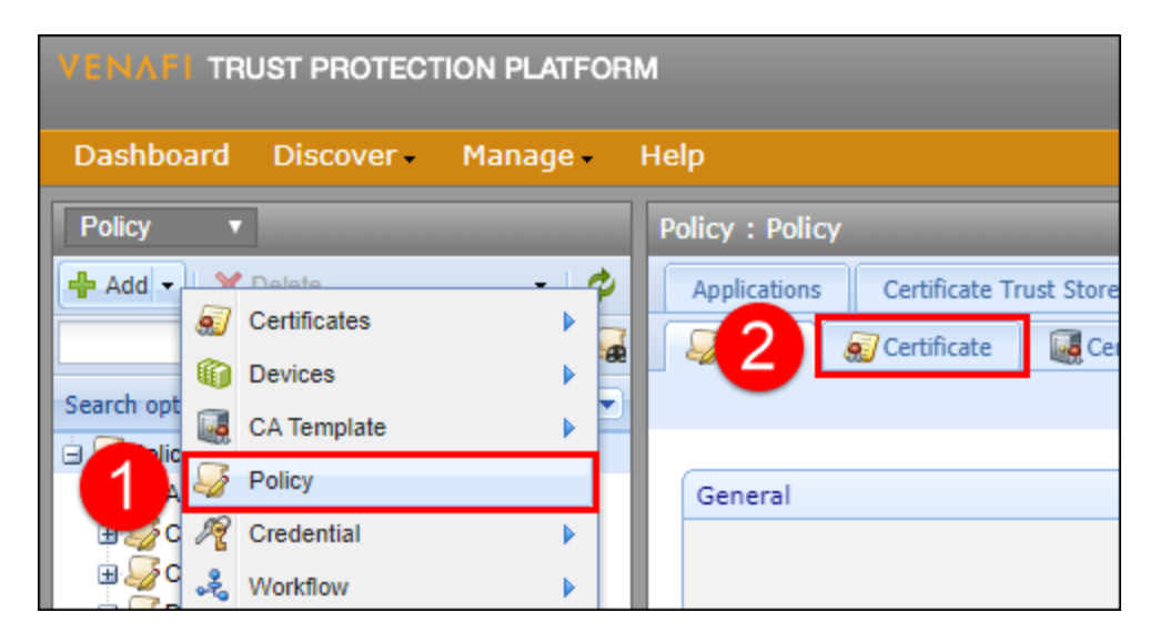
FIGURE: CERTIFICATE POLICY CREATION